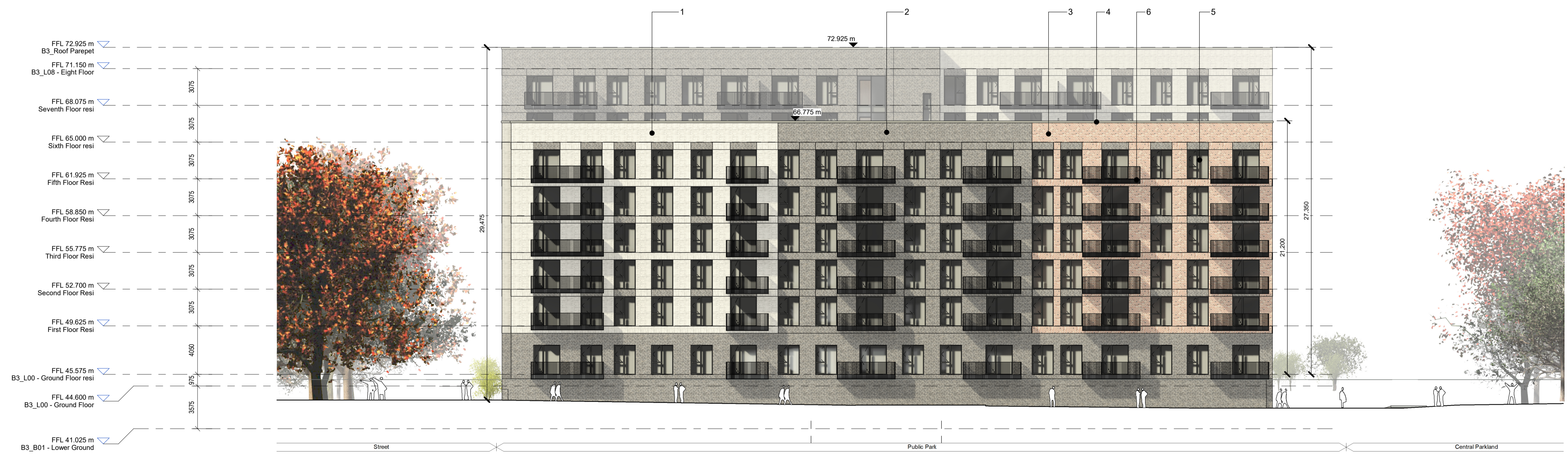
East Elevation 1 : 200

Notes: - Do not scale from this drawing. Use figured dimensions in all cases. - Verify dimensions on site and report any discrepancies to the Architect immediately. - This drawing is to be read in conjunction with the Architect's Specification. - © This drawing is copyright and may only be reproduced with the Architect's permission.