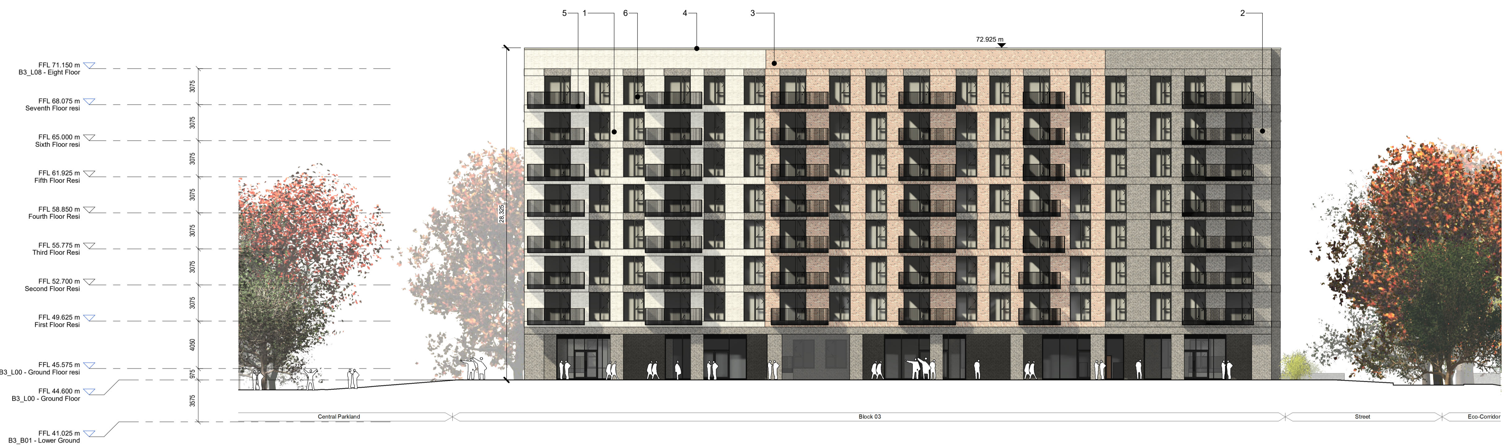
West Elevation 1 : 200